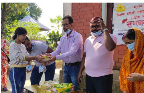
Local donations by JCI Duhabi