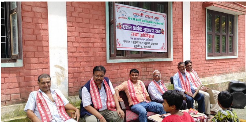
General assembly meeting.

No formal meeting was held during this month, Chairman of DH and Secretary of Home visited home for inspection of home and work of staff members. General assembly meeting was held on 30 th July 2022.