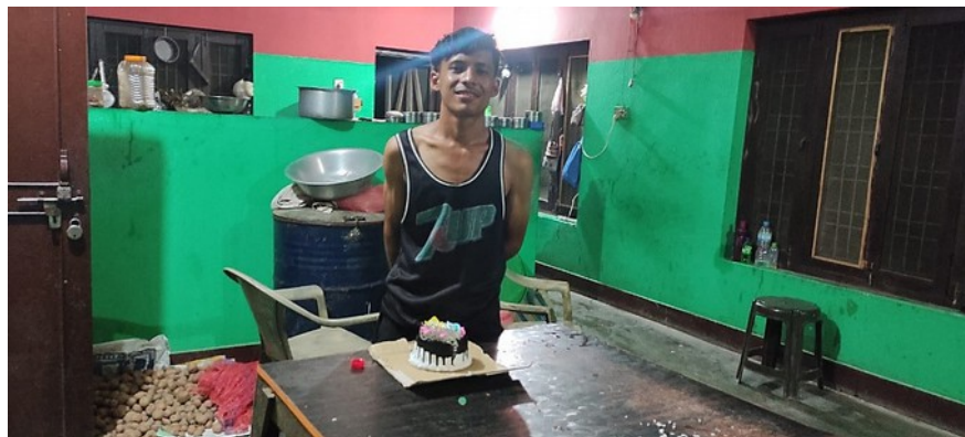
Celebrated birthday of Toyaz.

Children were having their first terminal examination by 10 th of July to 20 th of this month. All of them have attended their examination and performed well. Most of the time children were engage with their study then playing and watching television.